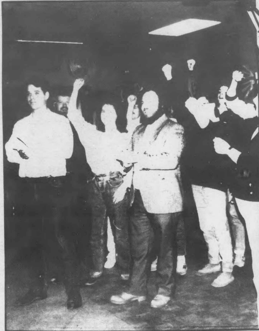
SUB Rock '89 - The great crowd goes wild as Bono of U2 belts out Sunday Bloody Sunday . Downstairs, the Rolling Stones & INXS were shaking in the BlueRoom and Cafeteria.