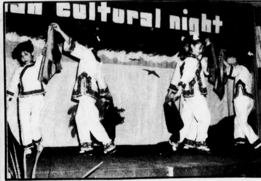
international night lends its aesthetic pleasure to an appreciative crowd

dia, Nepal is to the East, and China to the North.