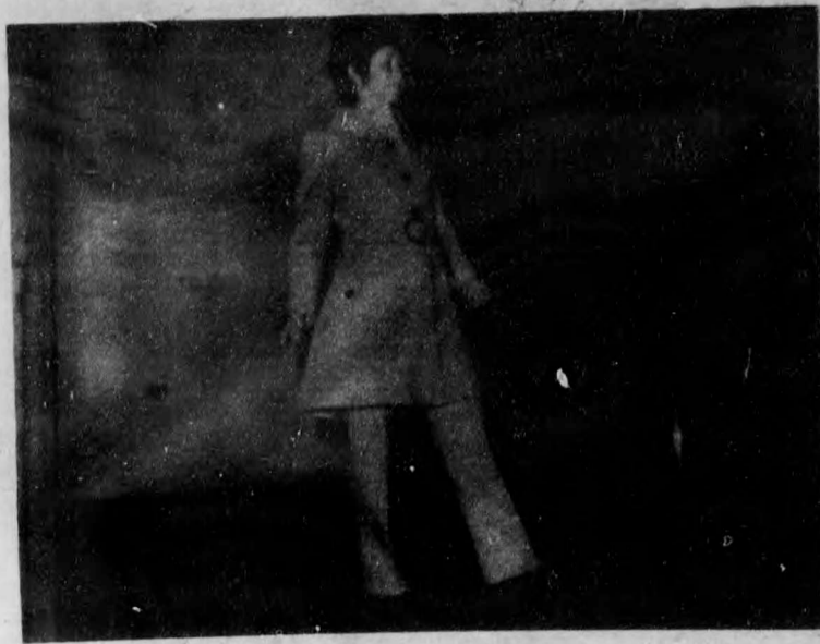
Madame X, above, models one of the latest designs in pants suits. She is only one of the many beautiful girls who displayed the latest fashions in different styles of dress at the Fashion Show sponsored by the Co-ed Club. - macdermott