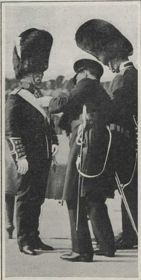
Lord Roberts Being Decorated With a Shamrock at the Parade of the Irish Guards.

THESE few pictures somewhat focus the agitation which, in the minds of some people, seems to threaten the solidarity of the Empire. There is no more inspiring military spectacle in England than the regular review and parade of the four great Guards regiments representing the three peoples of the United Kingdom. It is spectacles such as this that inspire the Britisher with a profound admiration for his King and country. Just at present Ulster is providing a different and much less gorgeous spectacle, of volunteers arming and drilling in the woods to resist Home Rule. The statesmen and generals presented on this page are all inspired by what they consider their highest duty to the Empire and to the United Kingdom. Various opinions may be politically held of Col. Seely, the Minister of War, who resigned because of the Government's imbroglio with the troops of Ulster. Nobody can doubt that the courage of Lord Roberts in the battle-fields of the Empire, or of General French in South Africa, is at least equalled by the courage of Premier Asquith in taking over the portfolio of War in the emergency which his Government has precipitated. Whether Home Rule is right or wrong, the sincerity and courage of Premier Asquith are beyond the shadow of a doubt.