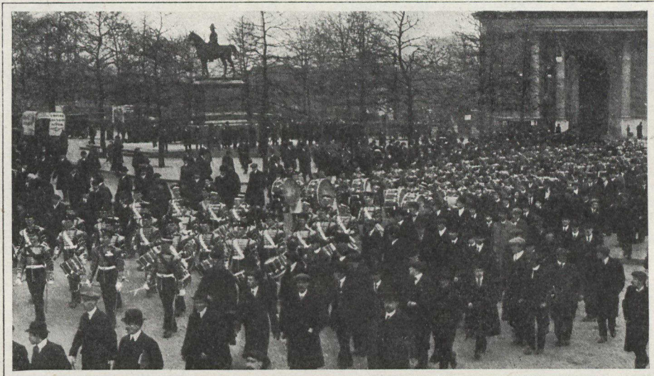
The Annual Review and Parade of the Grenadier, Irish, Scotch and Coldstream Guards Regiments, With the Three Massed Bands at the Head, is the Greatest Unionist Spectacle in England. The Parade is Here Seen Passing Hyde Park.