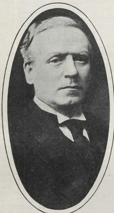
The Premier Who Becomes an Emergency Minister of War. He Has Staved Off the Immediate Necessity for a General Election by Going Up for Re-election to His Own (East Fife) Constituency.