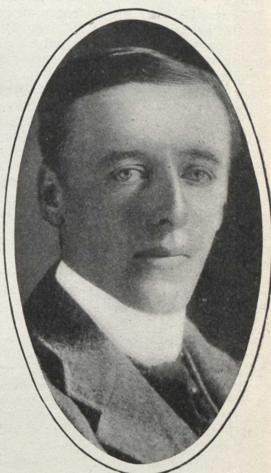
Col. Seely, the Secretary of State for War, Who Has Resigned. The Emergency Which Brought it About Has Been Considerably Cleared Up by the Statements of General Sir Arthur Paget to the Government.