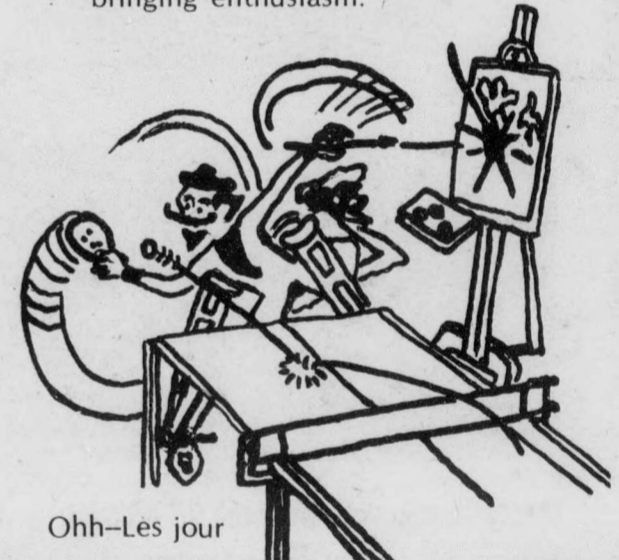
Ohh- Les jour

Leisure is like a cold drink on a summer's day... Delicious, refreshing and relaxing. Leisure should restore a feeling of well-being to both mind and body enabling a person to feel optimistic, able to cope with life and capable of bringing enthusiasm.