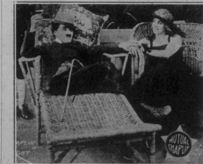
Charlie Chaplin in "Chase Me Charlie" at the Regent Today and Tomorrow.

In her new Goldwyn Picture with the interesting title of "Spotlight Sadie," Mae Marsh comes to the Monarch Theatre, Thursday, Friday and Saturday of next week, and the star promises to give an uncommonly good account of herself. She is Sadie Sullivan, a timid new-comer in the hours of a Broadway