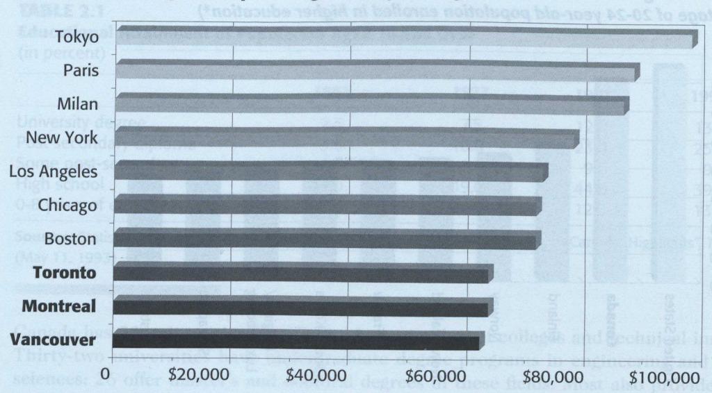
Figure 2.2: Average Salary for Engineering Managers*