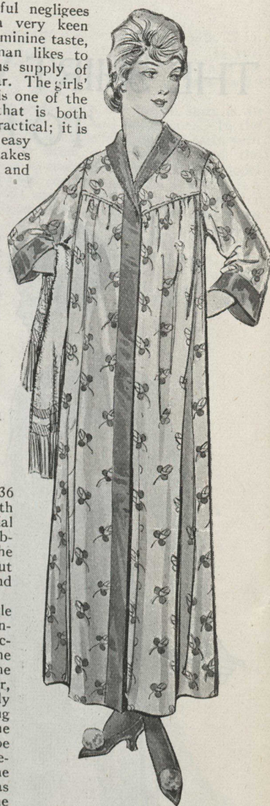
No. 8551—Price of pattern, 15c.

Pretty, graceful negligees always make a very keen appeal to the feminine taste, and every woman likes to have a generous supply of dainty underwear. The girls' kimono (8551) is one of the available sort that is both attractive and practical; it is very simple and easy to make, yet takes most becoming and graceful lines.