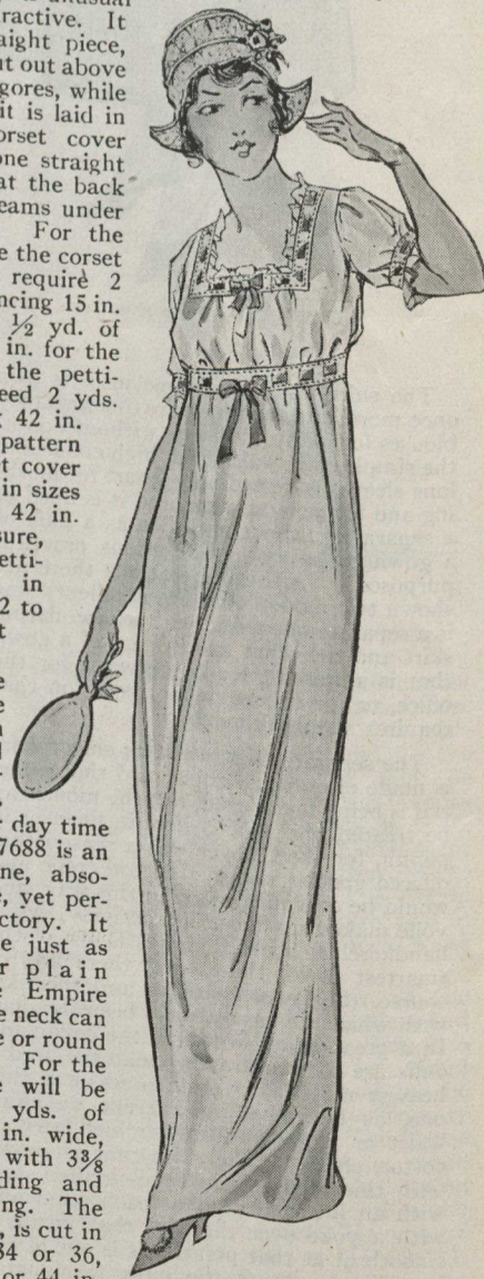
No. 7688—Price of pattern, 15c.

Patterns of styles shown above will be mailed to any address upon receipt of price. When ordering be sure to state clearly your name and address, number of pattern wanted, age or bust measure, and address, Pattern Department, Everywoman's World, Toronto, Ont.