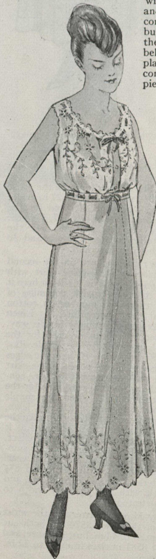
Nos. 8300-7981—Price of pattern, 15c.

Empire effects are greatly in vogue, and are liked for night gowns as well as for day time wear. No. 7688 is an attractive one, absolutely simple, yet perfectly satisfactory. It can be made just as illustrated or plain without the Empire band, and the neck can be cut square or round as preferred. For the medium size will be required 4 yds. of material 36 in. wide, 3\frac{1}{2} yds. 44, with 3\frac{3}{8} yds. of beading and 3 yds. of edging. The pattern, 7688, is cut in three sizes, 34 or 36, 38 or 40, 42 or 44 in. bust measure.