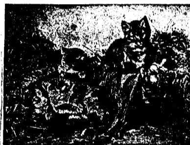
A KITTEN FAMILY.

Among them are an oblong marine; a "Moonlight on the Snow"; Japanese lilies; "On the