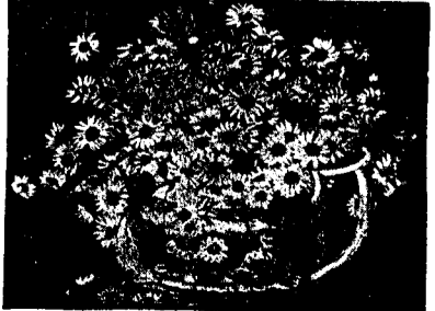
DAISIES IN BLUE NEW ENGLAND TEAPOT.

Catalogue of studies and descriptive circular sent for stamp.