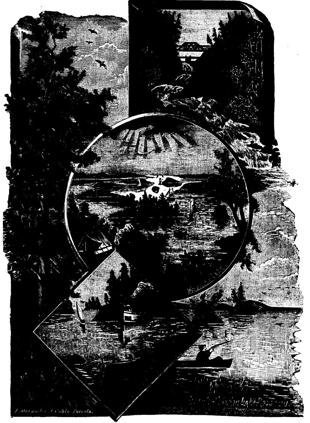
Bits in Muskoka