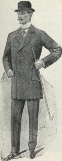
No. 148. Suit to measure in good navy serge or Irish tweed $14.50

Tell us to send you free samples of the exceptional values in new autumn fabrics that we sell by the yard or piece or make up to your measure and guarantee satisfaction. Hand-some showing in Coatings, Dress Fabrics, Tweeds (English, Scotch, Irish) Venetians, Velvets and