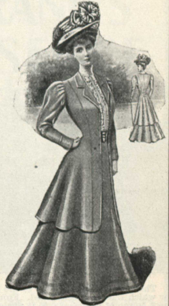
No. 470. Costume to measure in good navy serge