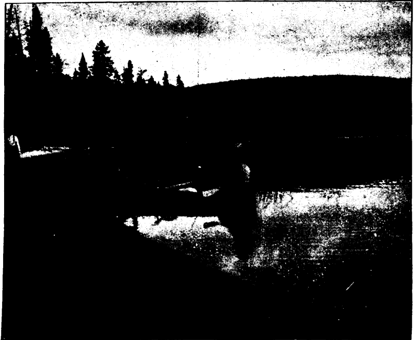
AN UNNAMED LAKE

The General Passenger Department, Montreal, P.Q., will answer enquiries, and send copies of Game Map, Fishing and Shooting and other useful publi- cations, on application.