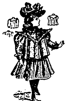
1371—Girls' Empire Jacket. sizes 1, 2, 4, 6 years.