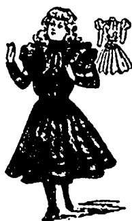
1375—GIRLS' DRESS. Sizes 6, 8, 10 12 years.

Lawrence Building 190 to 196 West Broadway, NEW YORK.