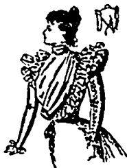
1337—LADIES' WAIST. Sizes, 32, 34, 36, 38, 40.

We will be pleased to furnish information Write for particulars