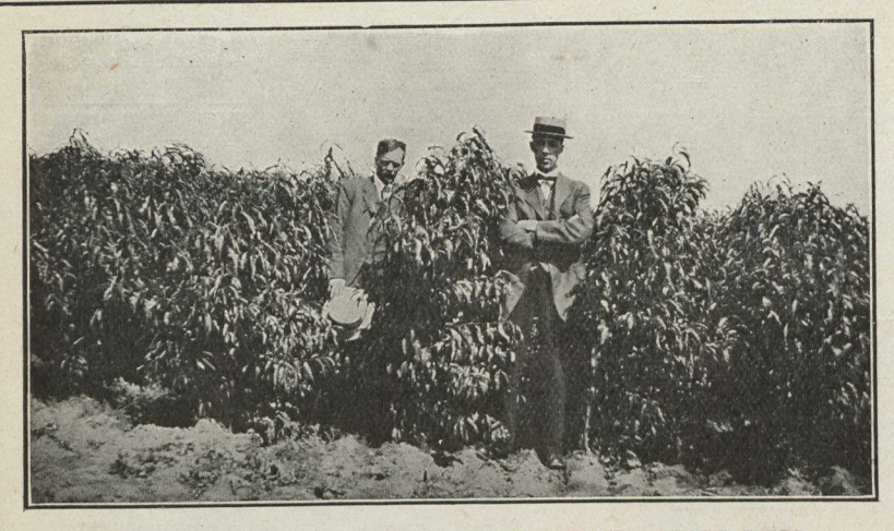
PHOTOGRAPHED IN AUGUST-BLOCK ONE- YEAR PEACH TREES