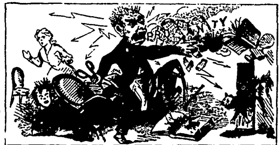
MARK TWAIN'S DESCRIPTION OF HIS INVENTION: