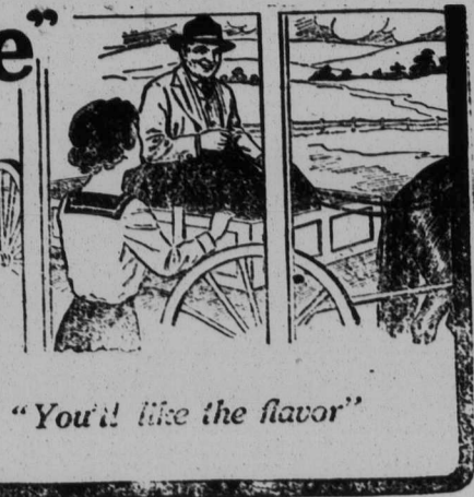
"You'll like the flavor"