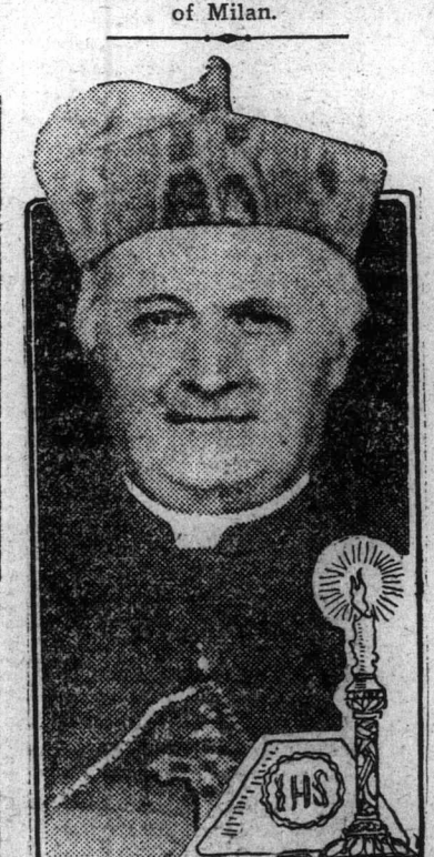
eral to the Pope.

You save time and money by going direct to Cromptons for Rugs