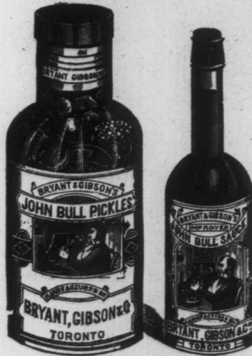
This is a facsimile of our bottles.

BRYANT, GIBSON & Co., TORONTO, Manufacturers of