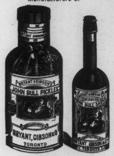
This is a facsimile of our bottles

"Worcestershire Sauce," "Yorkshire Sauce" "Devonshire Relish" Raspberry Vinegar, Evaporated Vegetables, Chocolates, Cocoas, Confectionery.