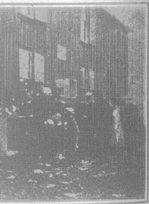
Exhibit at Palmerston Fair.

administering punishment I that the new teacher will ys will "try her out," deliber- how cross she is going to be. perhaps roam the piece of dden by the last teacher), or after the noon hour just to ll happen. If the new teacher for a little talk after four and you must not do that again". e certain they will do it again. meant what she said. When punishes them for that offence promptly try something else