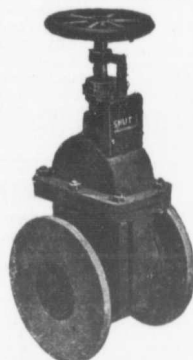
Indicator Gate Valve.

Railway Supplies, Structural and Ornamental Iron Work