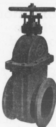
Flanged End Gate Valve with Hand-Wheel.