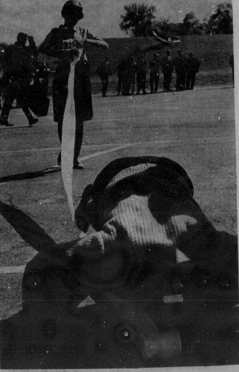
New University students got an introduction to campus life last week, but students will get more serious as classes get under way for another eight months.

Features writers can become part of the Brunswicken staff by writing or telephoning the Brunswickan office in the Students Centre.