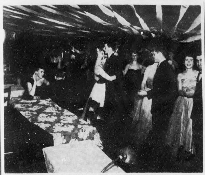
A view of last Friday's Residence Formal