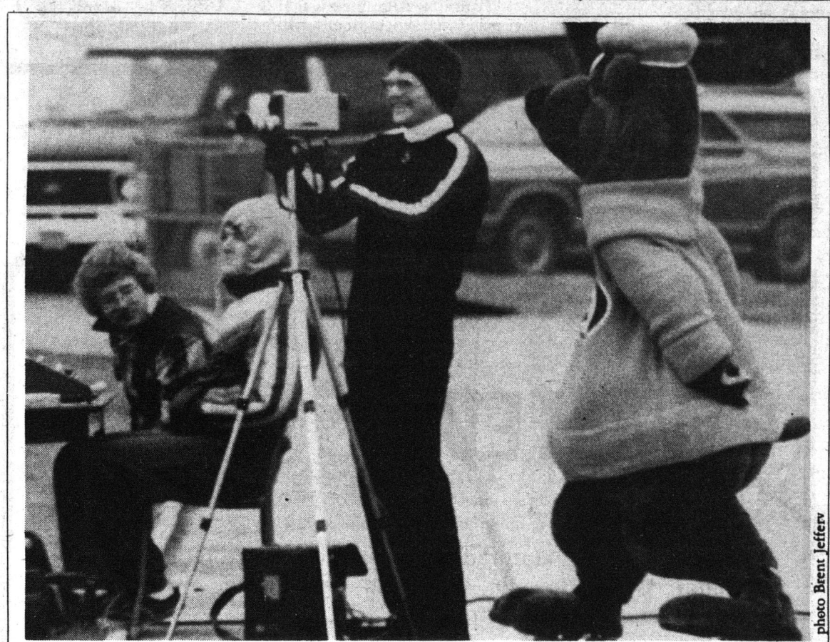
So you think that one's funny? The Great Root Bear took in Saturday's football game at Varsity Stadium.

The Tenants' Association understood that if the Jubilee continued on page 2