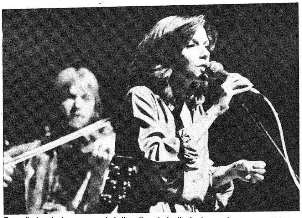
Cano displayed why some people believe them to be the best group in contemporary music, at SUB Theatre.