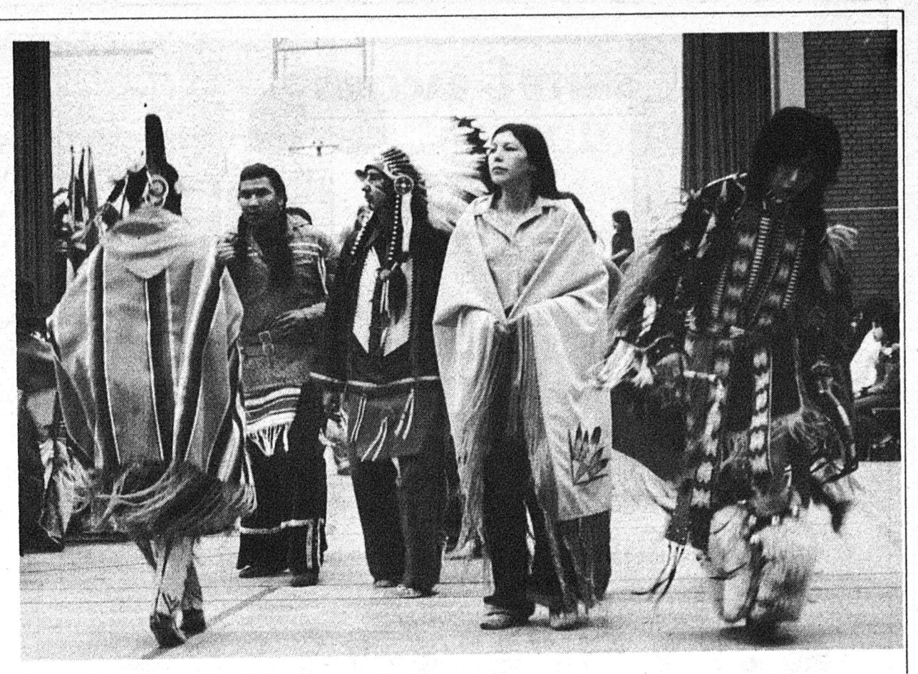
Dene nation pow-wow during Native Awareness Week on campus.