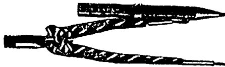
Compass, No. 753. Warwick Bros. & Rutter.

Another new line shown by this house, which is meeting with marked success, is the "Khaki" pencil, a cut of which is also shown herewith. This pencil is a high-grade rubber-tipped pencil, the wood having the