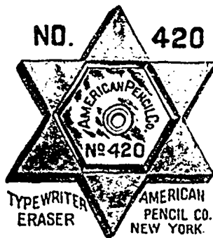
Eraser No 420. Warwick Bros. & Rutter.

Warwick Bros. & Rutter have just opened a shipment of the newest shade in fine notepaper and envelopes. It is known as the "Chippendale," and is made in the green shade of the famous Chippendale china. It is carried in bulk in the two square sizes,