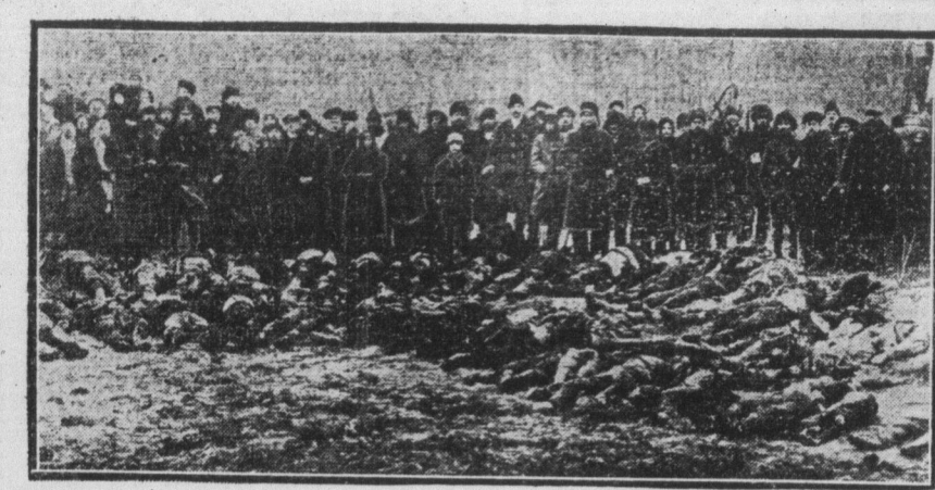
TESTING OF THE BOLSHEVIKI—HUMED FROM A POND INTO WHICH THEIR BODIES HAD BEEN THROWN. At Wessenberg in the Province of Estonia, about fifty bodies of murdered people, most of them mutilated so that identification was impossible, were exhumed from a lake into which they had been thrown by the Bolsheviks. Those who could be identified were mostly owners of railroads and posts.

Premier Hearst after reviewing at some length the Government's policy with regard to prohibition pointed out that the questions of the referendum are submitted in such a way as not to split either the wet or the dry vote. Each question stands by itself he stated and on each the voter must