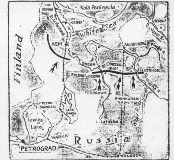
CANADIAN ARTILLERY IS ON THE ARCHANGEL FRONT, where with other allied forces theirs is reported to be considerable danger. The above map gives a rough idea of the situation. The Bolsheviks have forced the allies back more than a hundred miles from the Shenkursk region. They have driven down the Dwina and Onega rivers and already have driven the allies away from the Waga River.

made in Canada. Bicycle. There is none better. See us now. DOBBIN GARAGE, Waterloo.