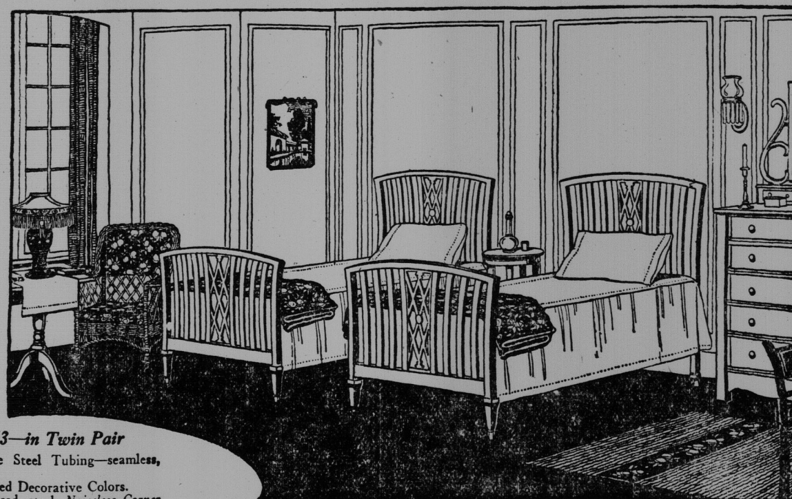
The "TUDOR" No. 1963—in Twin Pair Made of Simmons' new Square Steel Tubing—seamless, smooth and beautifully finished. Exquisitely enameled in the accepted Decorative Colors. Has the Simmons patented pressed steel "Wireless Corner" lock. Easy rolling casters. Your choice of Twin Pairs and Double Width. Especially pleasing in Twin Pair.

A post card to us will bring you the names of Simmons merchants near your home.