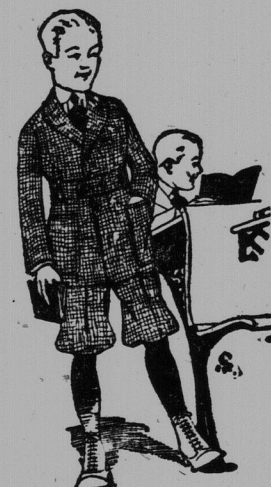
Light Road Clothing