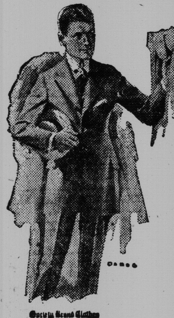
Heavy Road Clothing

Stores Open 8.30 a.m., Close 6 p.m.—Saturday 10 p.m.