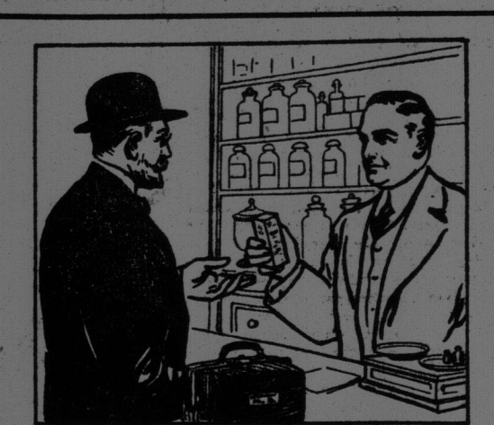
Here's Your 100 Grains of Caffeine, Doctor!