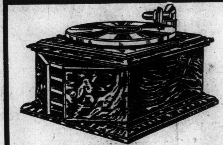
Victrola VI $32.50. Oak.

A group of French scientists who have been investigating have decided that small insects, in proportion to their size, are stronger than larger ones. In an aviation school in Berlin the machines are suspended from a circular track until the students learn enough to be trusted to operate them free from control. By introducing minute particles of zinc into the tissues by powerful electric currents a Philadelphia surgeon destroys cancers and has effected many notable cures.