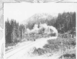
E. & N. Railway Views.