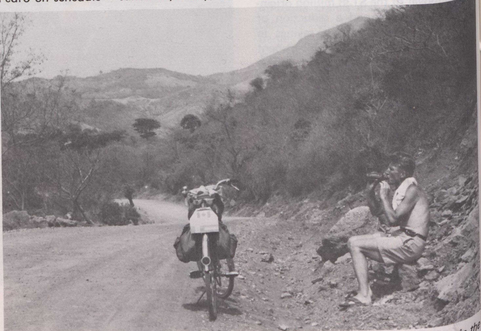
The Canadian flag, almost faded by the sun, is still visible. Paul takes a breather in the hot, parched remote border region between Guatemala and Honduras. He used a self-timer for this photo.

In Paul's own words: "With the help of the Lord above and some good people on earth, my mission was accomplished. I had covered some 2 400 kilometres in Central America overland, visited eight SOS Villages and projects in four countries on my bicycle, and all on next nothing camping outside and living of local produce. But the important point was that I did meet my foster children and spent some time with them, seeing