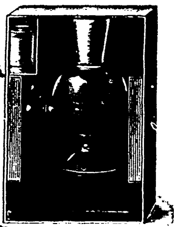
A New Model in Magic Lanterns which appears in several popular price sizes.—Nerlich & Co.

A BIRCH bark waste basket is indeed a novelty, and two sizes of these goods have just been received by Warwick Bros. & Rutter. They are well made out of solid wood, and entirely covered with bark in its original form, the top of the basket being faintly bound with sweetly perfumed grass. Another series of new baskets from the same factory is called "Sweet Grass." These are made from perfumed grass and in many fancy colors. Three sizes are shown, nested, so that dealers may procure a sample set conveniently.