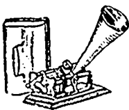
H. A. Nelson & Sons Co., Limited.

retails at 50c. Other toys are the mechanical bird, climbing monkey, mechanical horses and carts, etc. In iron toys they have between thirty and forty patterns which have never been shown in Canada before. They carry the graphophone in stock, as well as a full complement of accessories for it. Their chinaware