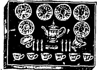
Fig. 2—Nerlich & Co.

Nerlich & Co. have secured an extra warehouse this season to store their stock of