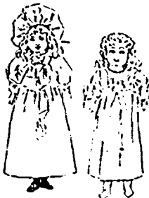
H. A. Nelson & Sons Co., Limited.

H. A. NELSON & SONS CO., LTD., are showing an extensive line of dolls for the fall and holiday season, numbering over two hundred distinct kinds, in dressed, undressed, jointed kid, patent head, and including special dolls, such as "the