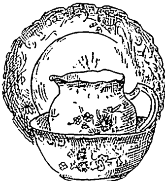
H. A. Nelson & Sons Co., Limited.

Their travelers are about to leave on their respective trips; in fact, a few of them have