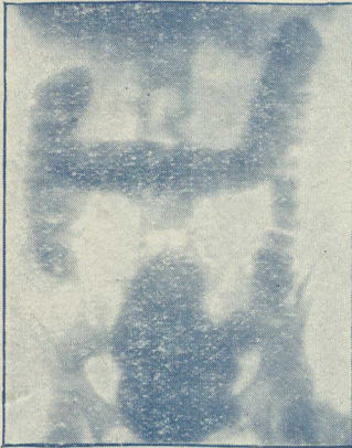
A Normal Colon