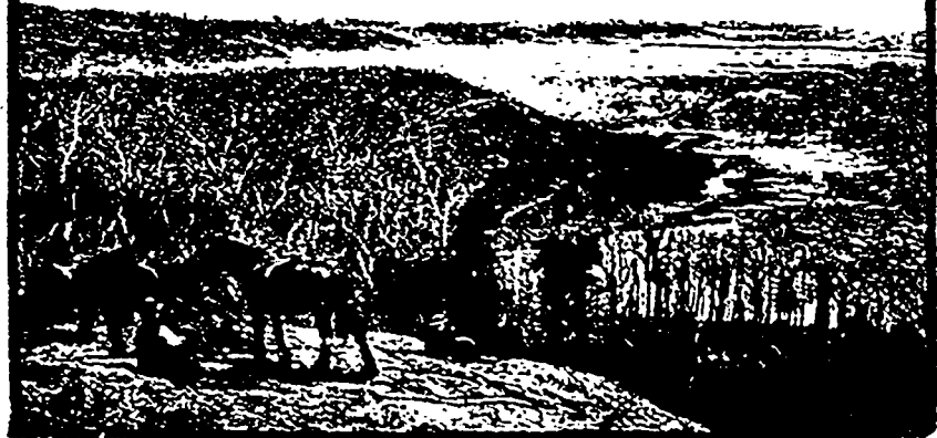
VIEW OF LOUHITT BAY, FROM MOUNT ST. GEORGE.

north, that the beauty of Queensland coast scenery comes into view. There magnificent vegetation is seen, extending down to the marge of the sea. Queensland has many specialties impossible in more temperate latitudes. The Stenocarpus Cunninghami , a proteaceous tree, displays, when in full bloom, one gorgeous mass of bright crimson stamens, tipped with orange. The silky oak ( Grevillea robusta ) has a downy foliage, nearly hidden by its flowers, resembling branched combs of crooked golden wire; and amongst the noble pines is seen the "bunya-bunya." In the warm, sheltered waters animal life abounds—that strange marine animal, the dugong, the bêche-de-mer—so dear to Celestial epicures—and the pearl oyster, which is to toilers of the sea what the coveted nugget is to the digger on land. Farther northwards the coast-line is very beautiful, and lovely islets stud the sunny waters.