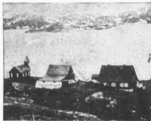
ILLUSTRATING "FARTHEST NORTH."