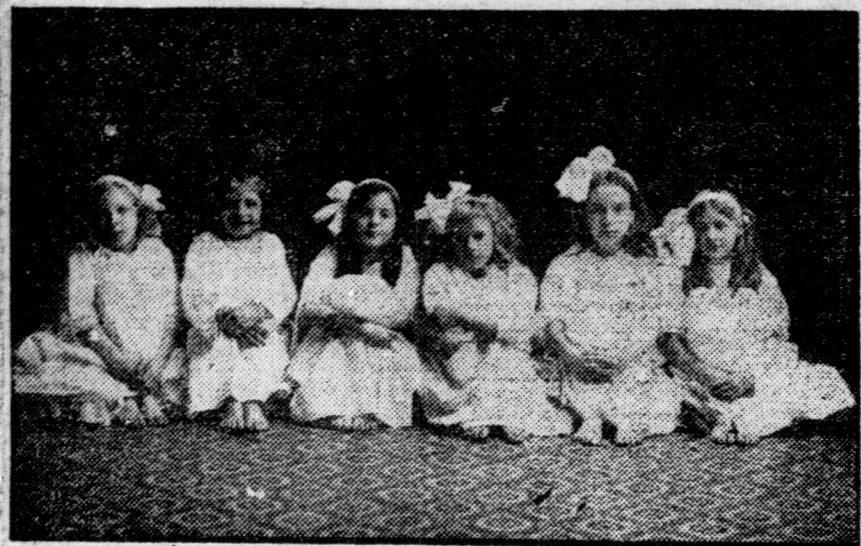
"GOOD-NIGHT" SCENE FROM "THE LAND OF GOLDEN DREAMS."