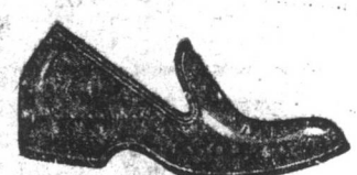
Women's Storm and Low Cut, Cuban, Military and Louis Heels.

Sizes up to 10 . . . . .85c. Tan—Sizes up to 10 . . .1.00 Black—Sizes 11 to 2 . . .97c. Tan—Sizes 11 to 2 . . .1.15