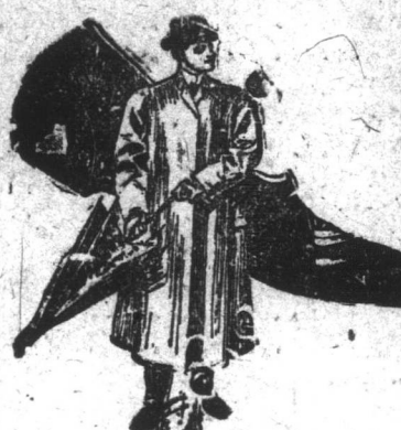
Men's Storm and Low Cut.

We were never better prepared with such leading brands as "Excel", "Merchants", "North British", "Gutta Percha"—all firsts, no culls or seconds.