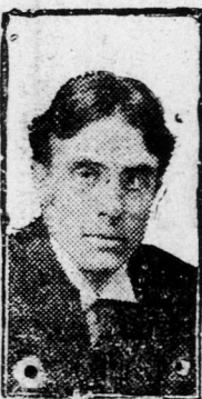
Humor drained in thought.

The comedian is a high-strung actor who retails jokes which do not have to be accompanied by explanatory foot notes or an out-line map.