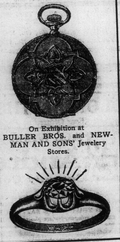
On Exhibition at BULLER BROS. and NEW- MAN AND SONS' Jewelry Stores.

Have you helped your favorite candidate with a subscription to THE DAILY COURIER? If you have not you had better do it to-day—remember, every subscription turned in before 8 p.m. SATURDAY NIGHT WILL COUNT FIVE TIMES as much in the way of votes as it will the last of the contest. The difference between the Grand Prize and the value of a single yearly subscription to The Daily Courier is so great that it should not be difficult for any candidate to secure subscriptions—readers and candidates, get busy to-day and tell your friends the difference in value in the prizes and the price of a subscription—explain to everyone that you can win if your friends all pull together. If you need any help, call the Contest Department—they are at your service.