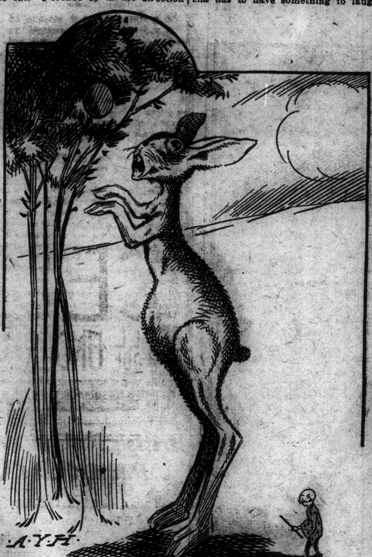
Longer and longer grew his hind legs, until he certainly was a queer-looking animal.