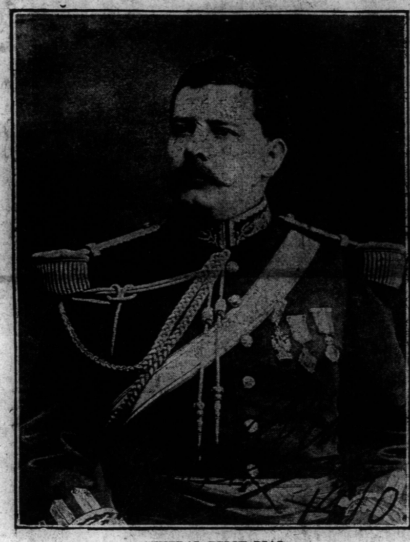
GENERAL FELIX DIAZ

These are the principal figures in the Huerta-Diaz compact termination act of the shifting drama in Mexico. General Diaz ended his compact with President Huerta, who now assumes entire responsibility for the government.