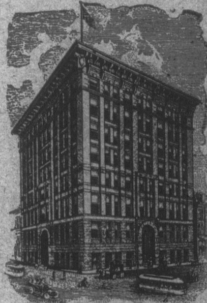
CONTINENTAL LIFE INSURANCE BUILDING

CASH ON DEATH. But some life companies pay more promptly than others. Death oftener than not comes suddenly, and what investment can be so rapidly or conveniently cashed, when the deceased's worldly estate is so often involved in confusion and uncertainty—as Life Insurance? The high reputation which The Continental Life Insurance Company have always enjoyed for prompt payment of proved claims, together with its conservative, sound management, confirm it as one of the safest insurance companies in Canada. This is one of the best reasons for its steady growth in public confidence and financial strength. Since organization the Company have paid to policyholders and their beneficiaries nearly a million and a half, and doubled its business in force every few years. During 1919, The Continental Life's business has increased so rapidly that by the end of the year it will have gained about three times the amount gained in 1918.