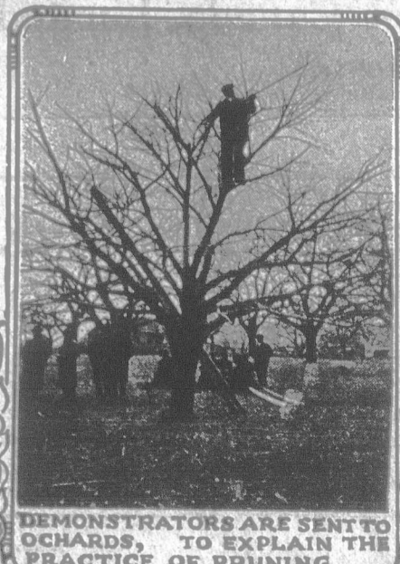
DEMONSTRATORS ARE SENT TO ORCHARDS, TO EXPLAIN THE PRACTICE OF PRUNING