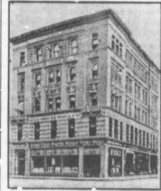
The Lawlor Building, Toronto

the Lawlor Building. It occupies a space with a frontage of 60 feet on King street and 90 feet on Yonge street. Last week the Manufacturers' Life resold this building and property to the Dominion Bond Company for $800,000. This means that in about a year and a half they have made a profit on this piece of property of $200,000. During that time they did nothing to increase the value of the property, and practically nothing