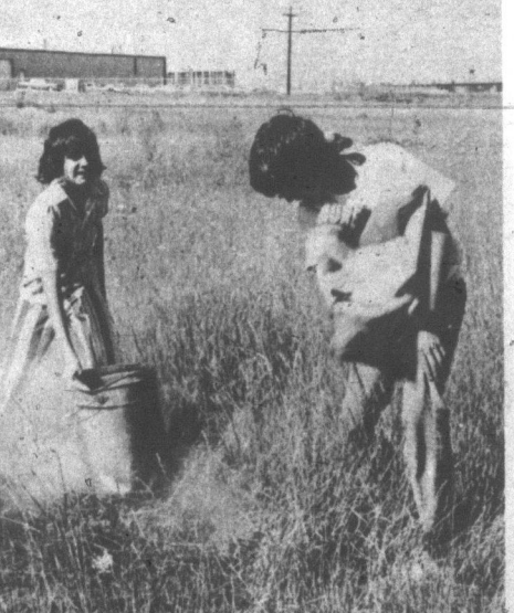
Junior fire brigade . .