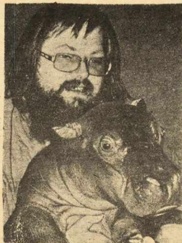
Editor's son and his pet dog Hattie.