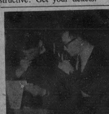
PRODUCER AT WORK

An attendance prize will be raffled off each night, courtesy of a downtown taxi company: 10 free taxi rides. Think of those long cold walks you might avoid, think of the fun you might miss, then stop thinking, and be constructive: Get your tickets!