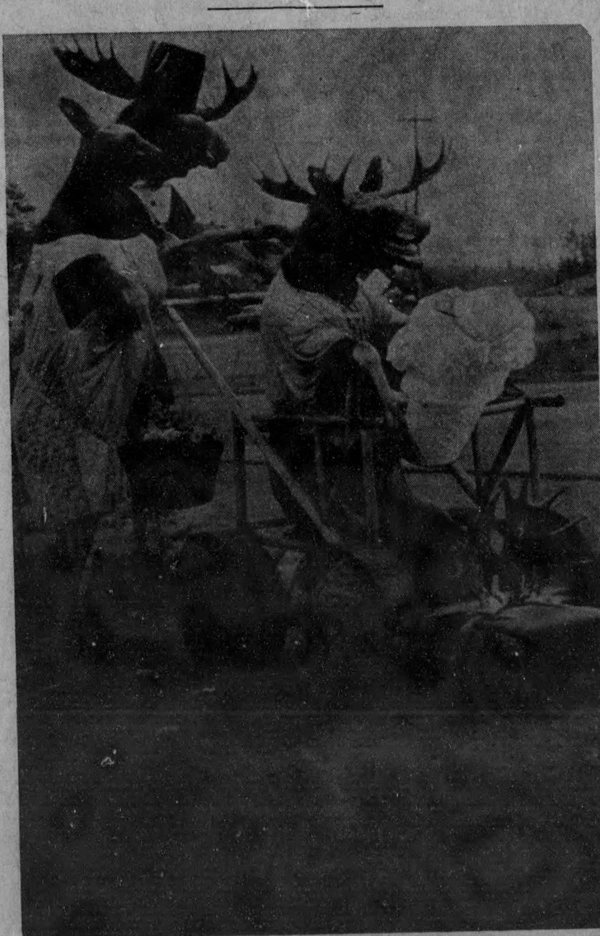
MOOSEHEAD SKIT IN ACTION

No more revealing of secrets. From the opening number, to the final "Bye Now", you will have a barrel of laughs, a truly monumental bash, and food for Student Centre conversation for weeks to come. Don't miss it!